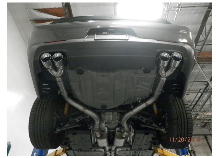
Step 7. Once the tips are removed install the Quad Tip Tailpipe Assemblies using the supplied 3.00" clamps. Locate both welded hangers to the rubber insulators.