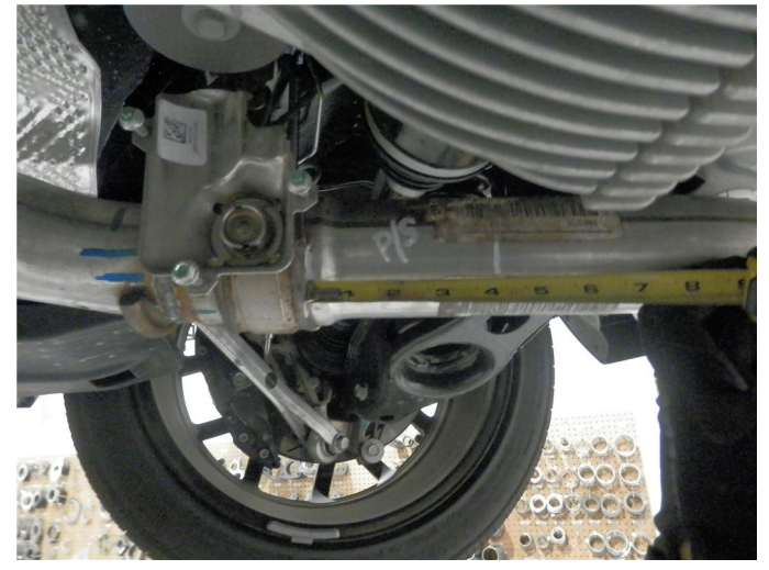
Step 2. For the passengers side cut 4" rearward of the outlet weld on the exhaust control valve as shown in the attached picture.

Step 1. Begin removal of the OEM system by cutting both side of the systems exhaust pipes. For the drivers side cut 4" rearward of outlet weld on the exhaust control valve as shown in the attached picture.