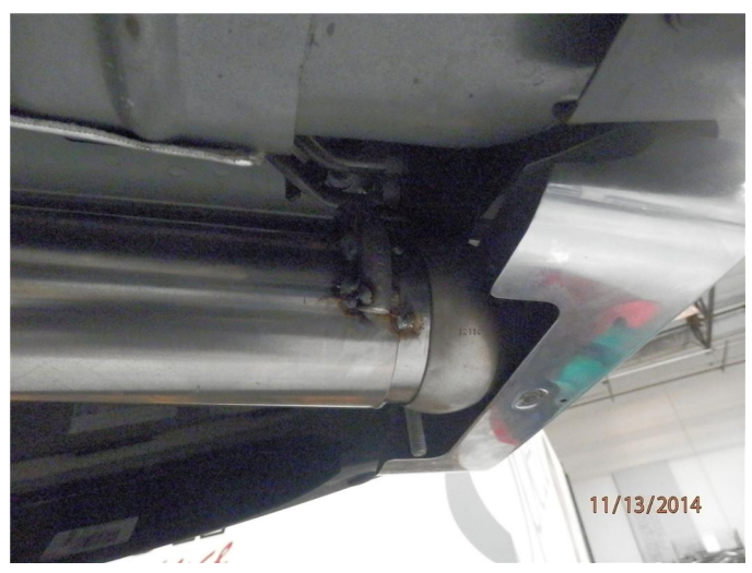
Step 5. To retain the OEM tips on your vehicle select the two OEM Tip Assemblies. The drivers side will be slightly longer. Loosely attach each pipe inlet to the Over Axle Pipes outlets using the OEM clamps. Engage the welded hangers for each to the rubber insulators.

Step 4. Begin installation of your new system by slipping each Inlet Pipe Assembly over the cut OEM outlet pipes. The drivers side pipe can be identified as the shorter of the two pipes Loosely secure using the supplied 2.75" clamps. At this point you have two options for tips. Magnaflow supplies a Quad tip setup or an extension pipe assembly to allow the original OEM tips. Select the desired option before continuing the installation.