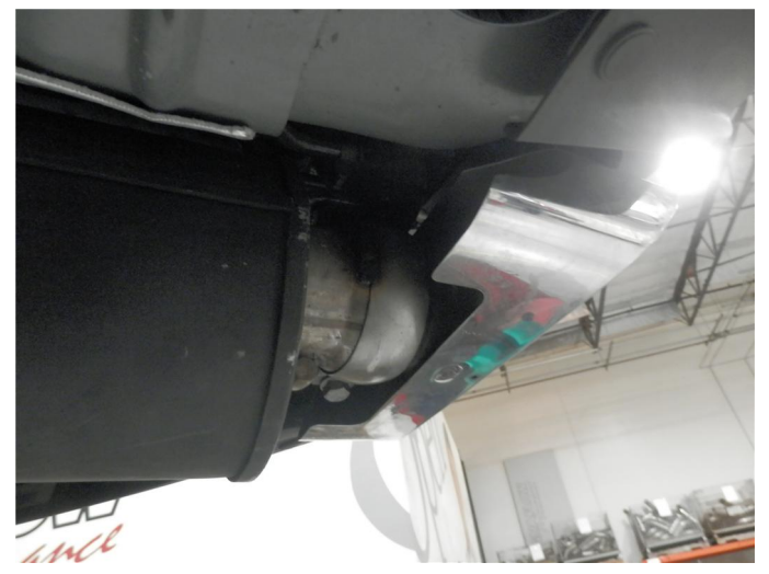
Step 6. To install the Quad Tip option supplied you will first need to remove the OEM tips from the vehicles valence. Remove the four bolts attaching each tip.